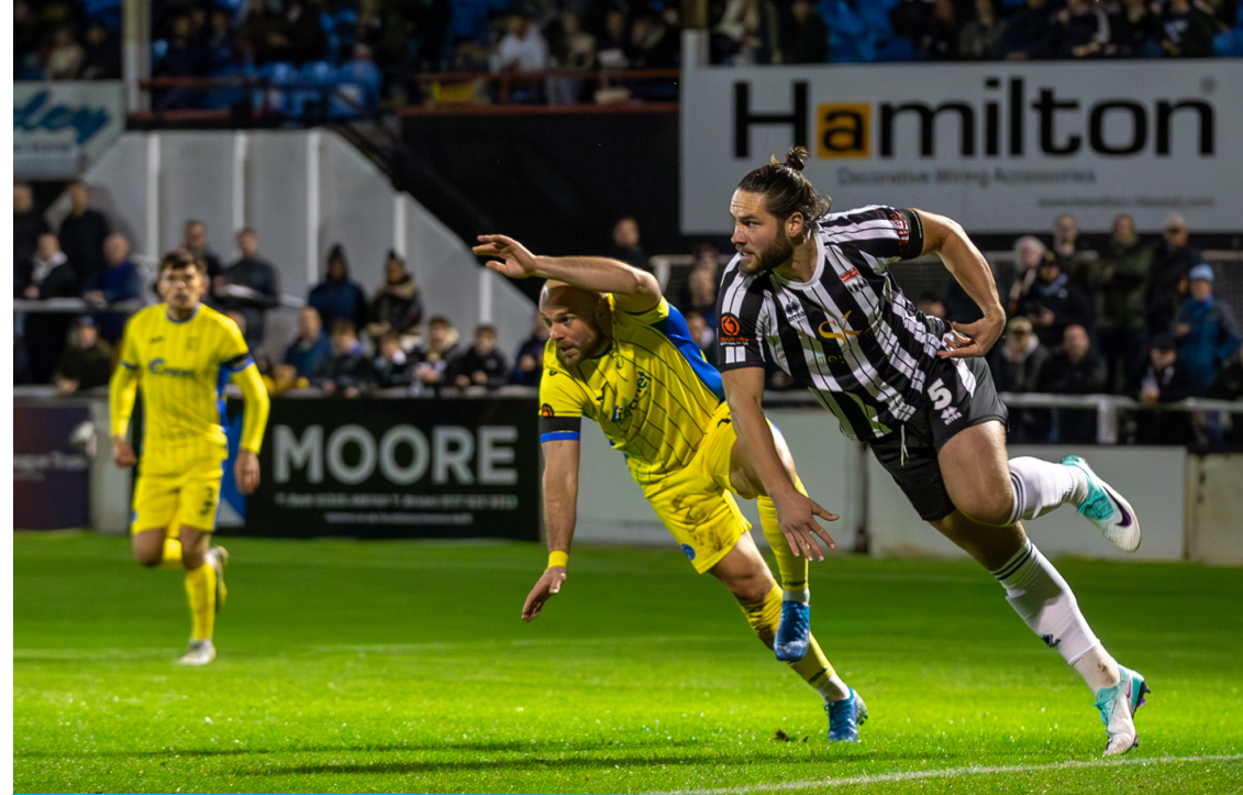
LAST TIME WE MET