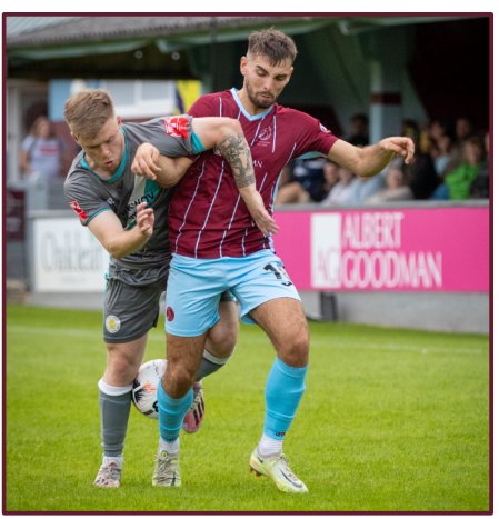
SWINDON SUPERMARINE 2 TAUNTON TOWN I