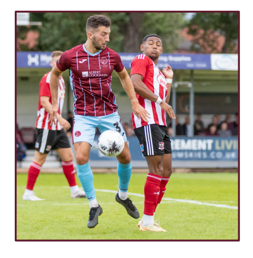
JULY 25™ 2023 TAUNTON TOWN I TIVERTON TOWN O