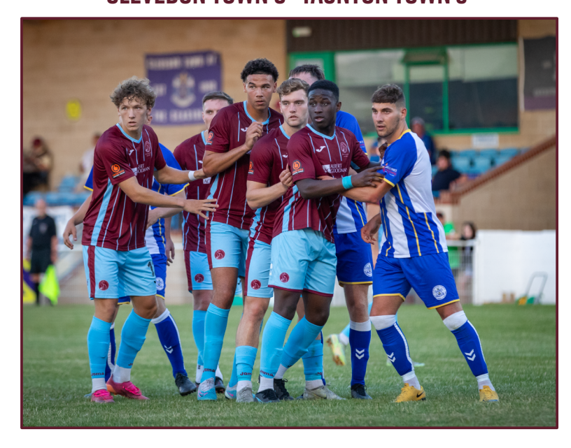
JULY 11™ 2023 CRIBBS FC O TAUNTON TOWN 1