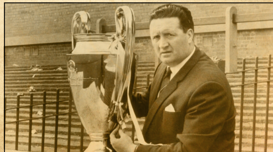
Jock Stein with the European Cup