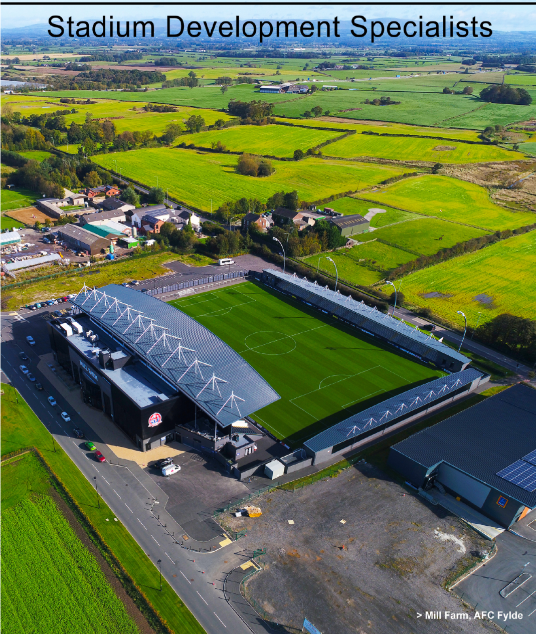
> Mill Farm, AFC Fylde

architecture • project management • structural engineering • interior design building surveying • m&e design • quantity surveying • cdm consultancy