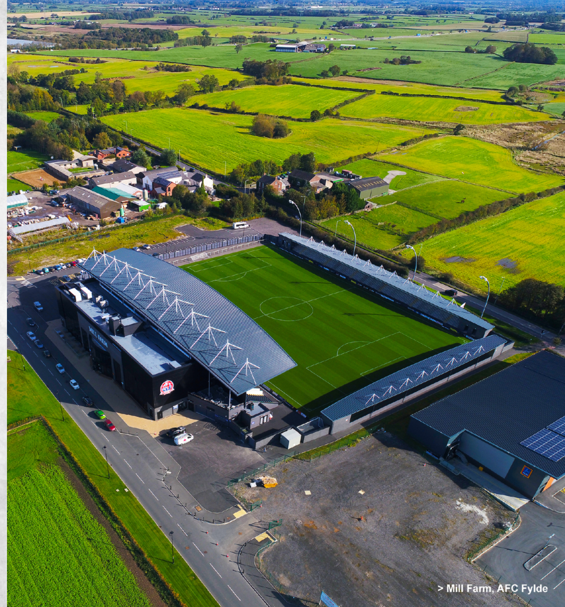
> Mill Farm, AFC Fylde

architecture • project management • structural engineering • interior design building surveying • m&e design • quantity surveying • cdm consultancy